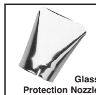
Glass Protection Nozzle